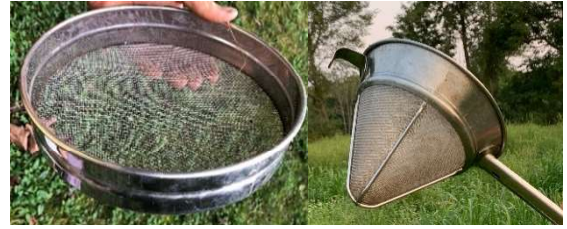
Examples of mesh strainers

If you must include pesticides with AEA nutrients, ensure the pH and EC lies within the range given on the pesticide label. Always perform a jar test first when integrating non-AEA materials.