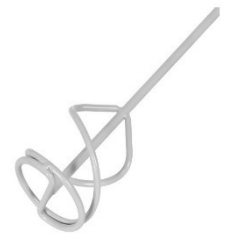
Example of drill mixer